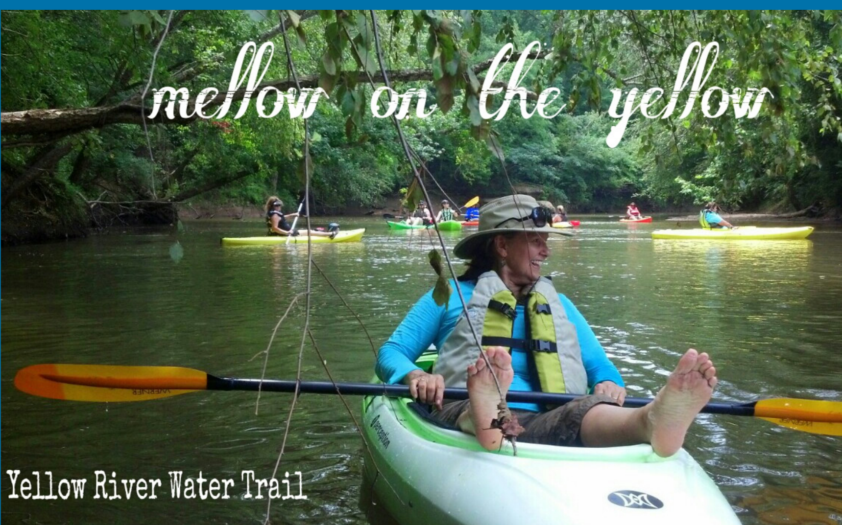
Yellow River Water Trail